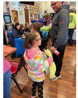
Children's Easter party.