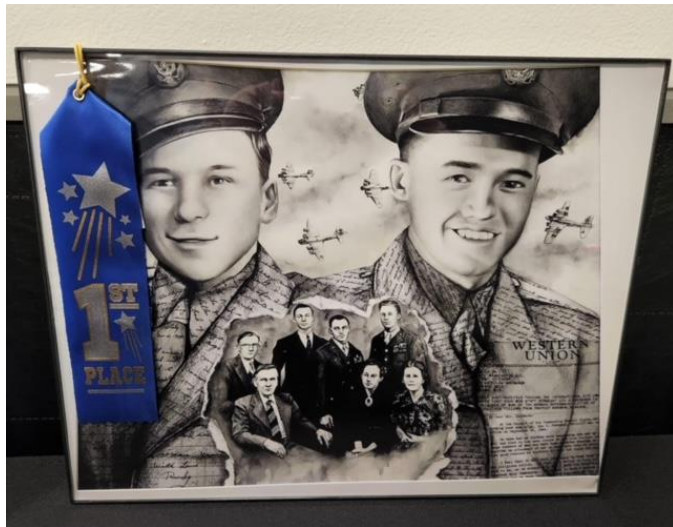
Patriotic Art 1 st Place Winner. Last year, Washington had the National Winner, Post 1474 had the State 2 nd Place entry.